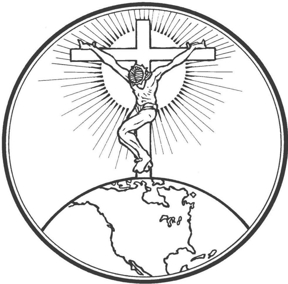
Christ the King