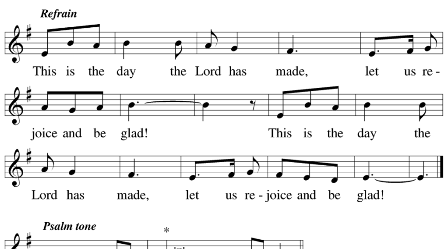
The LORD is my strength <u>and my song</u>; he has become my sal<u>vation</u>. The LORD's right hand is <u>lifted high</u>;